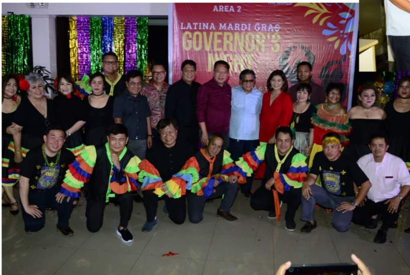
Nov. 15, 2019 Governor's Night with DG Philip Tan for Area 2 Clubs held at Pinacple Hotel...